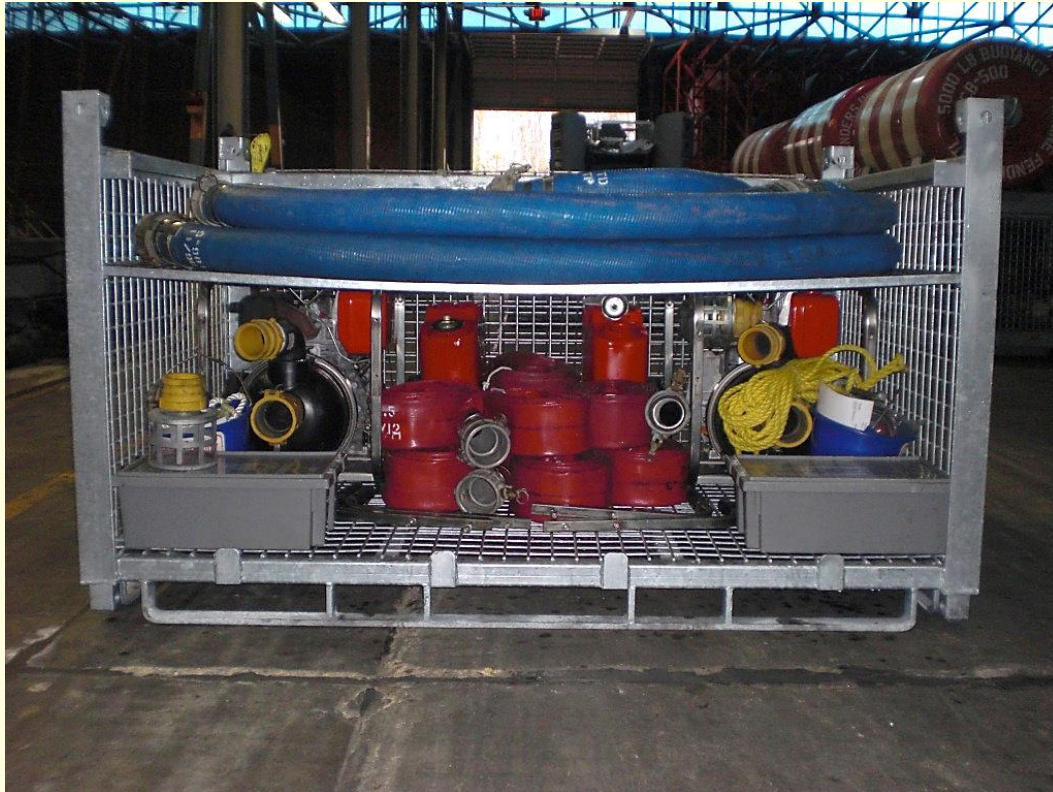
800-GPM 3-Inch Diesel Trash Pumping System S18210