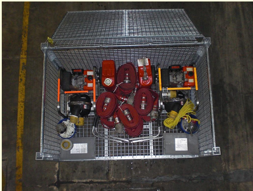
3" Trash Pump Ancillary Set PU0236 (Bottom Level View)

The Ancillary Set PU0236 is a wire mesh container used for storage and shipping of the pumps and spare parts kits in system S18210. The ancillary set also contains suction and discharge hoses, a strainer, various fittings, clamps, nipples, and other items necessary to support system operation.