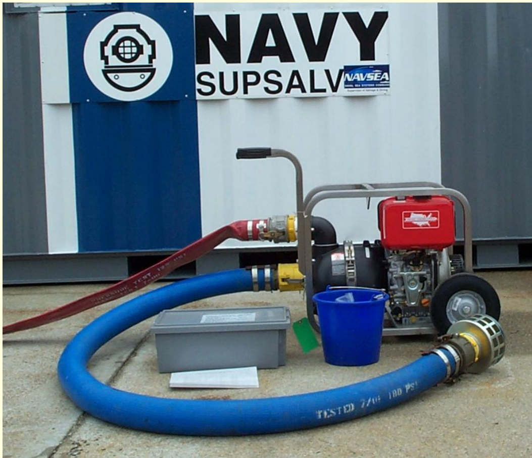
400-GPM 3-Inch Diesel Trash Pumping System S18200