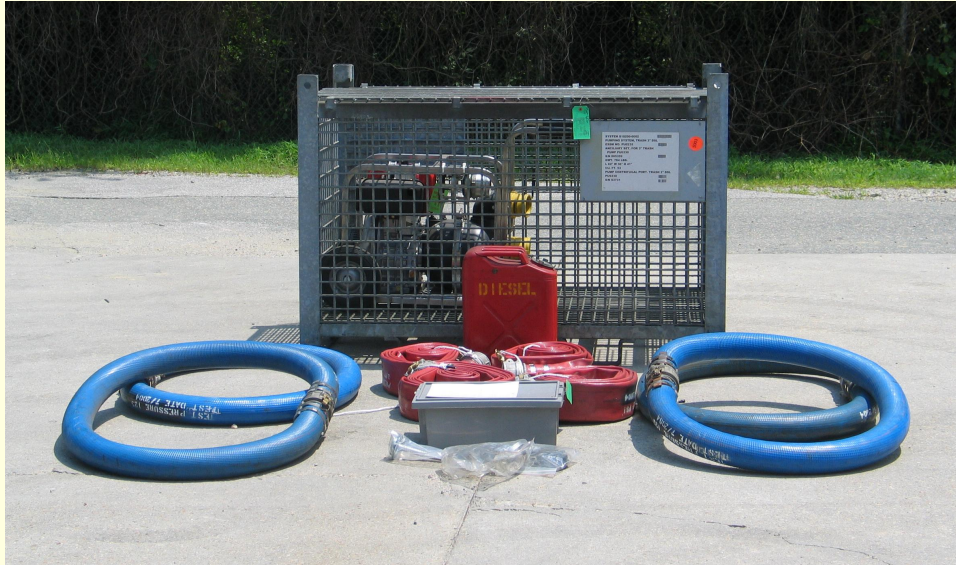
Ancillary Set PU0235

The Ancillary Set PU0235 is a wire mesh container used for storage and shipping of the pump and spare parts kit in system S18200. The ancillary set also contains suction and discharge hoses, a strainer, various fittings, clamps, nipples, and other items necessary to support system operation.