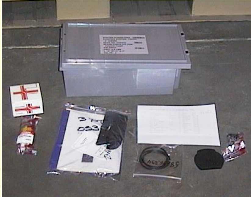
Spare Parts Kit PU0331

The Spare Parts Kit PU0331 contains items to support the operation and maintenance of one 3-Inch Trash Pump PU0330. The spare parts kit is shipped in the wire mesh container of the Ancillary Set PU0235.