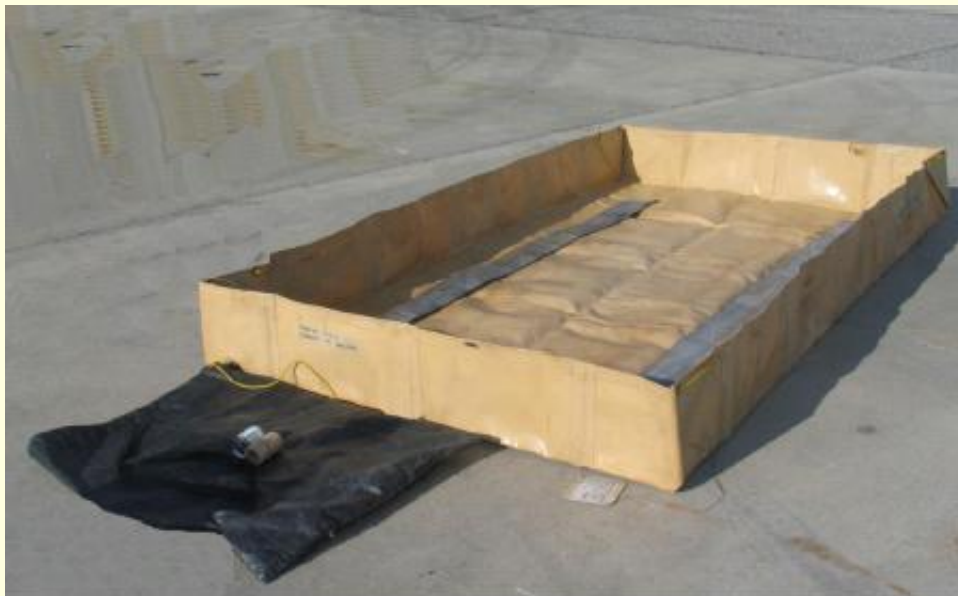
Machinery Containment Pool CP3010

The Machinery Containment Pool CP3010 is a 10' x 6' x 12" urethane berm. It is used to provide a means of catching and containing any oil, fuel, or contaminants, leaking or spilled from the operating equipment it contains.