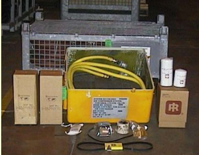
Spare Parts Kit for AC0330 Air Compressor AC0332

The Spare Parts Kit AC0332 contains the items necessary to support the operation and maintenance of one 175-CFM Air Compressor AC0330.