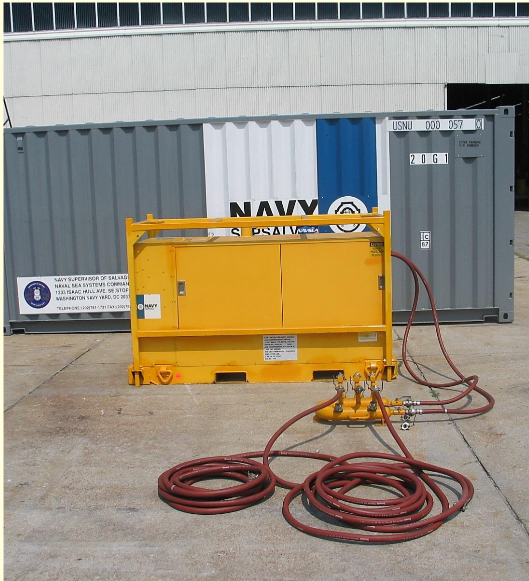
Overview of 175-Cfm Air Compressor System