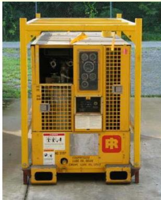
175-Cfm Air Compressor Controls and Gauges