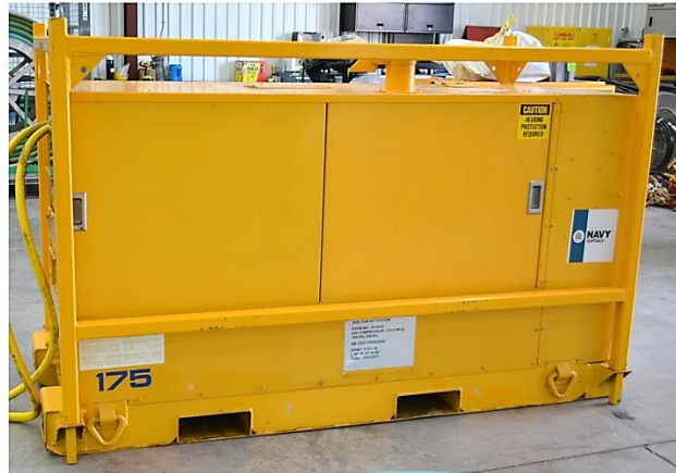
175-Cfm Air Compressor AC0330