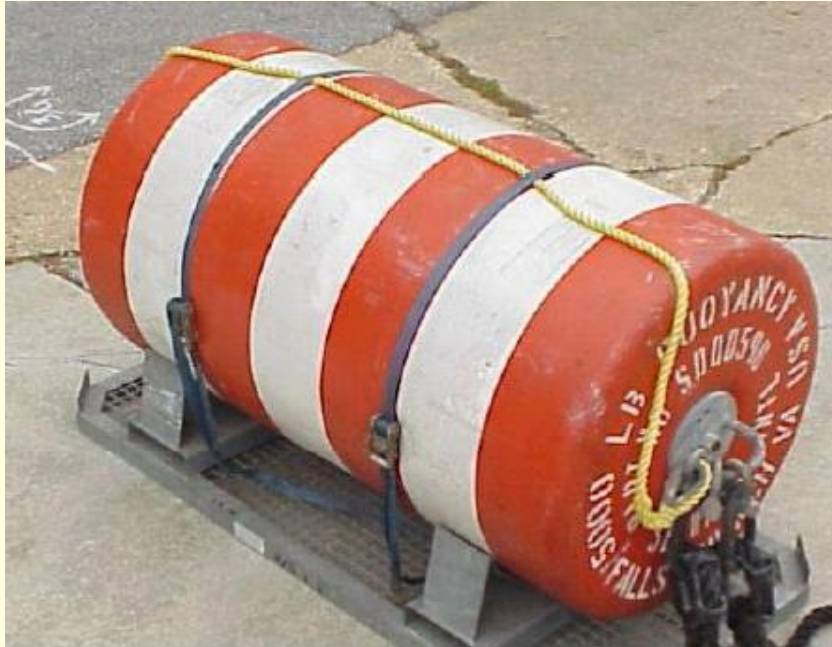
Mooring Buoy BU0140

The Mooring Buoy BU0140 is designed to provide buoyancy to the anchor line so that boom or boats can be fastened to the Boom Mooring System.