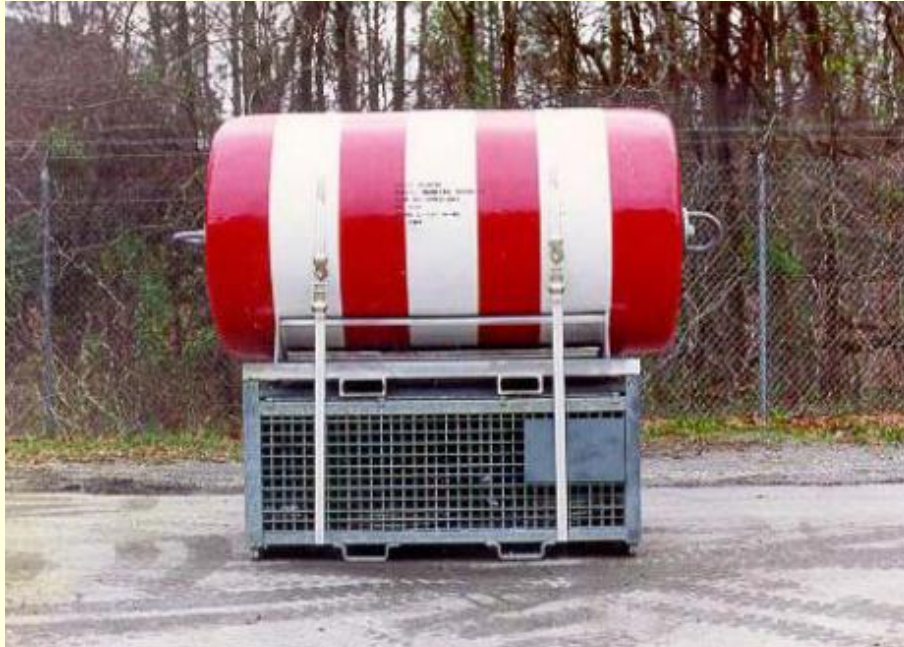
Boom Mooring System Deep Water Extension MS0020

The Boom Mooring System Deep Water Extension MS0020 is used to extend the working depth of the boom mooring leg to a depth of 600 feet. The system is designed to be used in conjunction with a Boom Mooring System when the depth of water exceeds 200 feet but is not greater than 600 feet.